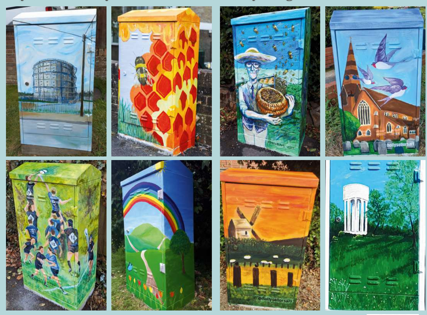
We would like to see more boxes painted, so if you would like to submit a design, scan the QR code or visit burgesshill.gov.uk/virgin-media-boxes/ for more information

Did you know they were commissioned by Burgess Hill Town Council?